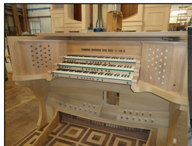
Organ console cabinet under construction