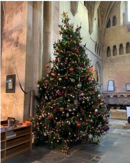
Pershore Abbey Christmas Tree, 2019

O CHRISTMAS TREE, O CHRISTMAS TREE, HOW LOVELY ARE THY BRANCHES!: Watch this space for news of the Abbey Christmas Tree, which we are hoping to have in place soon.