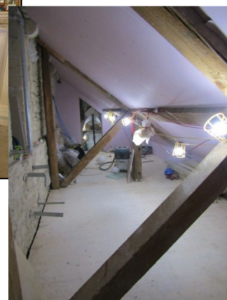
Blower room under construction

The full report can be viewed here: Fabric Committee Update November 2020