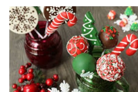
Sweets and Chocolates