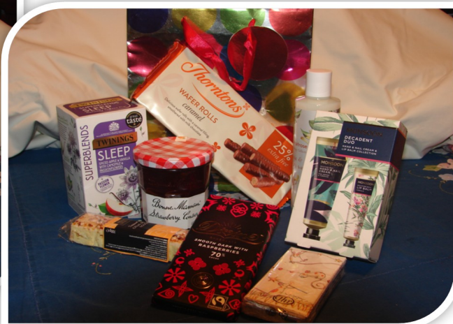
Examples of what your gift bag might include