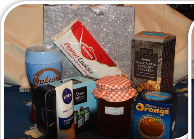
Examples of what your gift bag might include

The list is not exhaustive – you choose! Don't worry if you can't provide something from each group – top-ups will be provided.