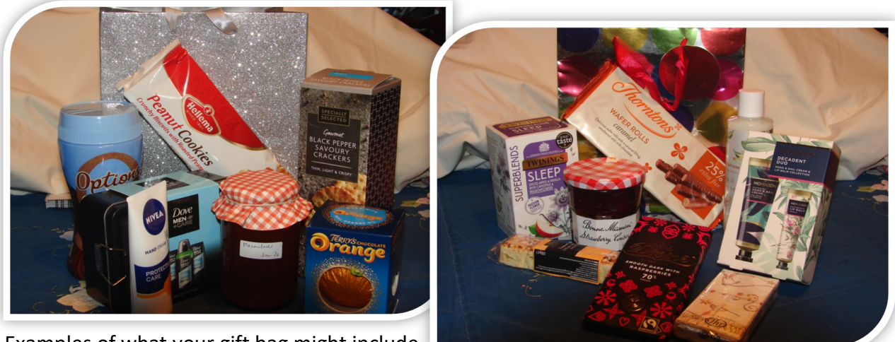
Examples of what your gift bag might include

The list is not exhaustive – you choose! Don't worry if you can't provide something from each group – top-ups will be provided.