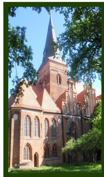
St Catherine's, Salzwedel