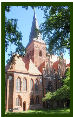
St Catherine's, Salzwedel